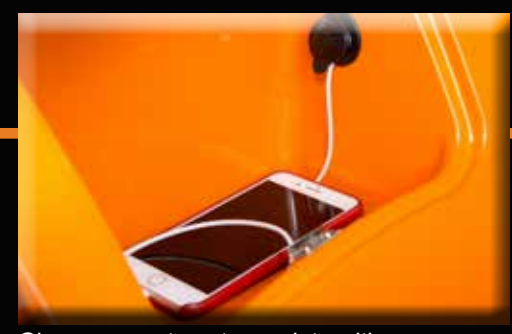
Glove compartment complete with USB charger