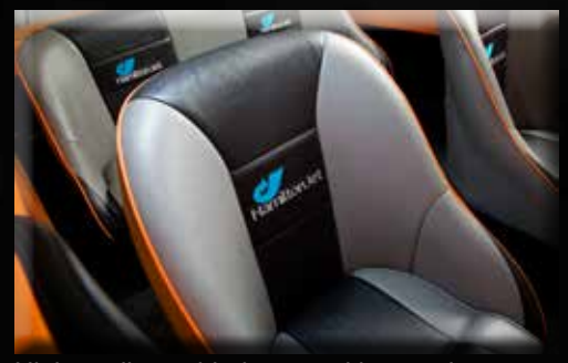
High quality molded seats with more leg room for driver and passengers