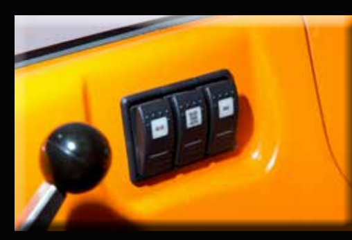
Key boat controls at your fingertips

Designed with the Kiwi jet boater in mind, the new HamiltonJet 470 breaks the mould for recreational jet boat design.