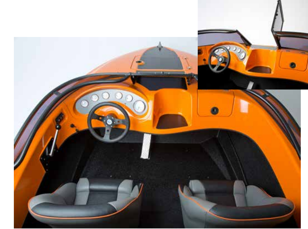
The large dash foot-well and walk-through windscreen provide quick, safe and easy access to the foredeck and bow. What's more, the handrail is positioned BEHIND the windshield for better warmth and comfort

The moulded fibreglass deck (a HamiltonJet tradition) allows for the 470's fluid curves and the seamless integration of hatches and insets from bow, through the dash and cockpit to the transom. Along with large fore and aft deck hatches, the 470 incorporates a dashboard glovebox on the passenger side, as well as an optional insert for the engine gauges, allowing customised gauge layout and easier access for maintenance.