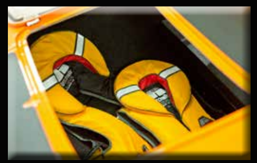
Large bow storage hatch