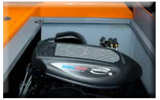
5.7 Litre Marine Engine