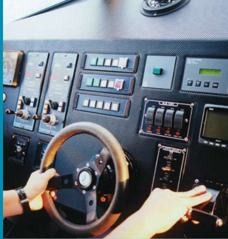
Typical MECS helm station.

In addition to the electronic modules, a complete system includes a jet mounted and driven hydraulic power unit (JHPU) on each jet, inboard hydraulic steering and reverse actuators and feedback units, engine and gearbox interfaces (or actuators) and other interfacing and sensing options.