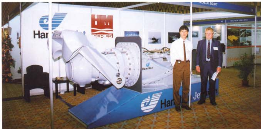
HAMILTON HM571 JET ON DISPLAY AT HIGH SPEED SURFACE CRAFT CONFERENCE

Operating from self-contained premises within the HamiltonJet plant with facilities for pattern making, stainless steel casting and precision machining, this team is responsible for the production of zero-defect stainless steel impellers, ready for passing to the next team involved in the production process.