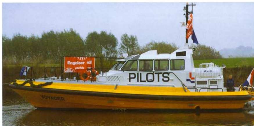
18.5 METRE PILOT BOAT 'VOYAGER' FOR THE DUTCH PILOTAGE SERVICE TWIN HAMILTONJET MODEL HM571 WATERJETS - SPEED 31 KNOTS