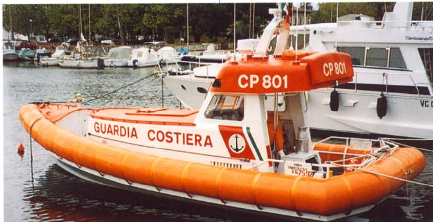
ONE OF THE SIX NEW ITALIAN COASTGUARD RESCUE CRAFT

Powered by twin HamiltonJet model 291 waterjets driven by Volvo TAMD 71B diesel engines, these self-righting craft have a top speed of 33 knots. Despite operating most of the time in sandy water, the KNRM advise