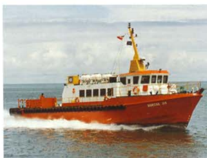
ONE OF THE NEW EAST MALAYSIA CREW BOATS WITH TRIPLE HM521 WATERJETS

Recent installations include triple shipsets of model HM521 into two new crew boats servicing the oilfields of East Malaysia.