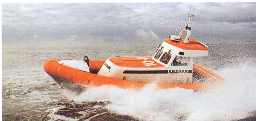
DUTCH LIFEBOAT INSTITUTION RESCUE CRAFT, 'VALENTIJN'

These craft are the culmination of a long evaluation process to determine a standard that will take these organisations through to the 21st century with a design that is ideal and proven for its intended role. These craft are another example of the proven suitability and acceptance of the HamiltonJet propulsion system for applications where effectiveness and reliability are paramount.