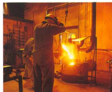
POURING STAINLESS STEEL IN HAMILTONJET'S IMPELLER FACILITY

One such team is that involved in producing stainless steel impellers, the heart of every Hamilton waterjet.